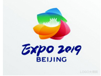
Fig. 4 The Expo logo for 2019

Wall. The peace flower with three colors and six-petals bears the concept of Chinese philosophy of six directions. Six directions generally refer to heaven, earth, east, west, north and south, which symbolize heaven and earth or the universe, and symbolize the world peace, and express the desire to build a beautiful home that lives in harmony. The ingenious fusion of the pistil and the Great Wall is uniquely crafted. The combination of English, Pinyin and numbers indicates the name, time and location of the conference. The logo not only has the modern atmosphere but also has an internal Chinese context, which integrates spirit of the orient with modern science and art to fully embody the unity of nationalization and internationalization. The logo is full of vitality. Although it is a flat figure, it has a three-dimensional visual sense.